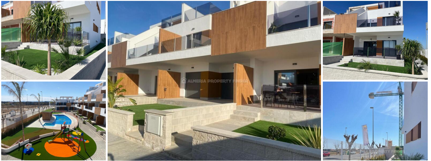
Lamar Resort Vii A11-b2 - An apartment in the Pilar de la Horadada area. (Newly Built)

LAMAR Resort Luxury VII is a luxury project of 34 apartments with 2/3 bedrooms and 2 bathrooms divided into 3 blocks with communal swimming pool, jacuzzi, gym, playground and garage with storage room. The ground floor apartments have large gardens, the first floor has terraces and the penthouses have a solarium with jacuzzi. The facades of these buildings are clad with high-quality ceramic tiles combined with a white dirt-resistant monolayer.