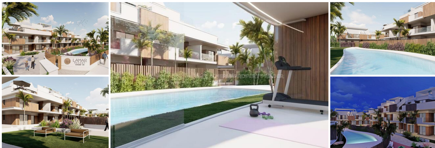
Lamar Resort VII P22-b2 - An apartment in the Pilar de la Horadada area. (Newly Built)

LAMAR Resort Luxury VII is a luxury project of 34 apartments with 2/3 bedrooms and 2 bathrooms divided into 3 blocks with communal swimming pool, jacuzzi, gym, playground and garage with storage room. The ground floor apartments have large gardens, the first floor has terraces and the penthouses have a solarium with jacuzzi. The facades of these buildings are clad with high-quality ceramic tiles combined with a white dirt-resistant monolayer.