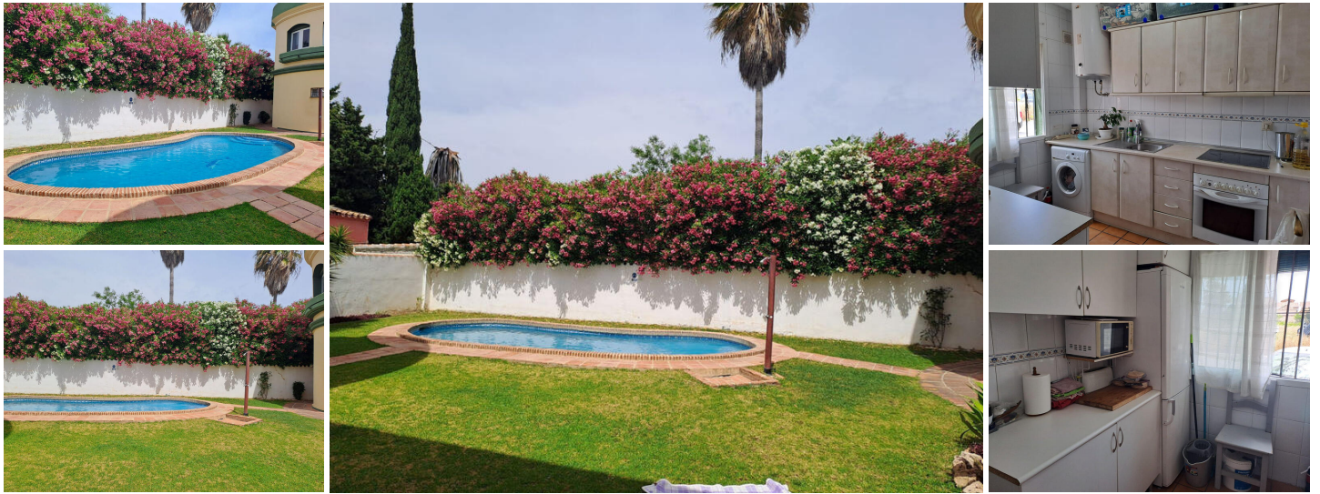
Beachside Bliss: One-Bedroom Apartment for Sale

Discover the perfect blend of comfort and convenience in this charming one-bedroom, one-bathroom apartment, ideally situated just steps away from the beach. This cozy apartment, boasting 50 m 2 of constructed space and 48 m 2 of usable area, offers a unique opportunity to enjoy a tranquil beachside lifestyle while being close to shops and transport links. Built in 1999 and well-maintained, this second-hand apartment is in great condition and ready for its new owner.