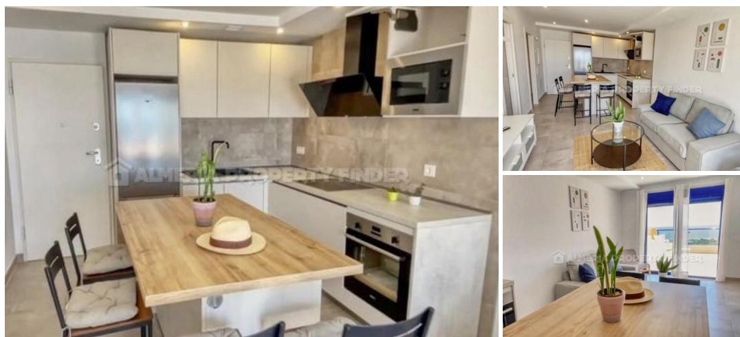
Apartment Mirador 4 - An apartment in the Mojácar Playa area. (Newly Built)