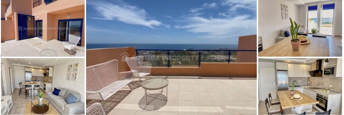
Apartment Mirador 1 - An apartment in the Mojácar Playa area. (Newly Built)