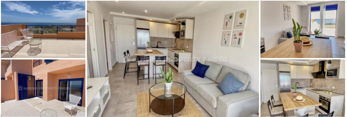
Apartment Mirador 2 - An apartment in the Mojácar Playa area. (Newly Built)