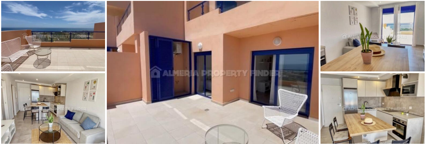
Apartment Mirador - An apartment in the Mojácar Playa area. (Under Construction)