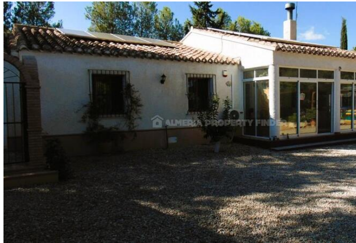
Casa Los Pinos - A country house in the Velez Rubio area. (Renovated)

Cortijo with 166 m 2 built area, 2,903 m 2 plot area, fully fenced, electric entrance gate, garden, tennis court, petanque court, covered outdoor bar, storage rooms, terraces, covered terrace, swimming pool with heat pump, solar panels, 5 bedrooms, 3 bathrooms, 2 dining areas, 2 living areas, 2 kitchens, 4 toilets, air conditioning, central heating, wood stove