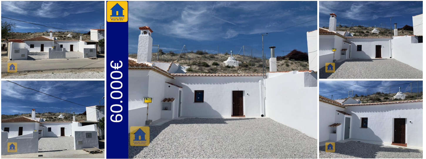
Cueva Mario 1 in Castilléjar

This is a brand new cave house, located on the outskirts of the peaceful, traditional village of Castilléjar, with views of the dramatic Badlands. This cave house is south facing and has a large front patio with ample space for parking. There is an open plan kitchen/dining/living room, three bedrooms (one walk-through) and one bathroom. The kitchen is prepared with all the connections (to be furnished by the new owner). Outside there is a small storage room with plumbing ready for a washing machine. A ventilation system has been installed throughout the cave. The property has been built with great care and quality materials.