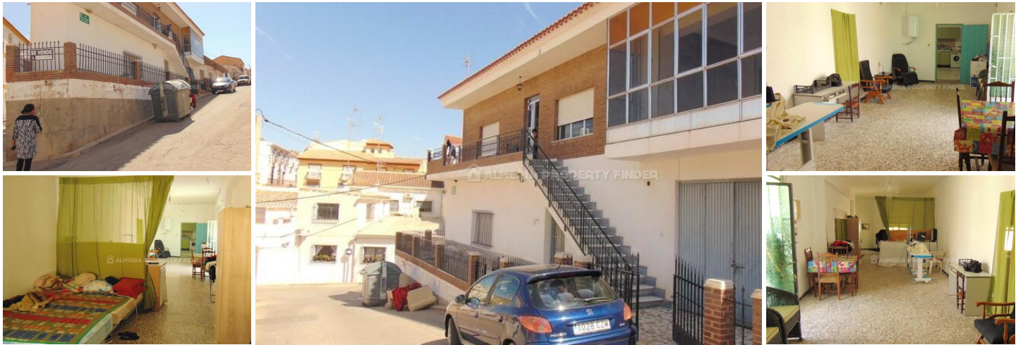
Casa Elena - A town house in the Zurgena area. (Resale)

This large village house is located in the center of Zurgena. Consists of a large open ground floor, garage, 2 bathrooms, 3 bedrooms, fitted kitchen, living and dining area, terrace and a city garden of 250 m 2