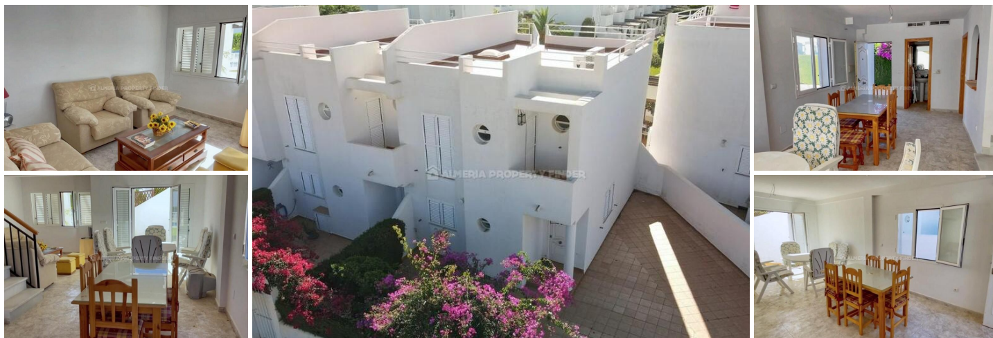
Casa Elisa - A duplex in the Mojácar Playa area. (Resale)

A lovely part furnished 3 bedroom, 1 bathroom corner duplex with a living space of 116 m 2 situated just 2 minutes walk from the beach in Urbanisation Chamberi II.