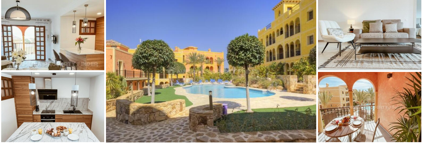
Desert Springs Sierra 346 - An apartment in the Cuevas del Almanzora area. (Newly Built)

Las Sierras III is a private residential development with a selection of NEW two and three-bedroom 'Key-Ready' Apartments set around a private swimming pool, complete with outdoor lounge space, within beautiful landscaped gardens, occupying an envious position on Desert Springs Resort.