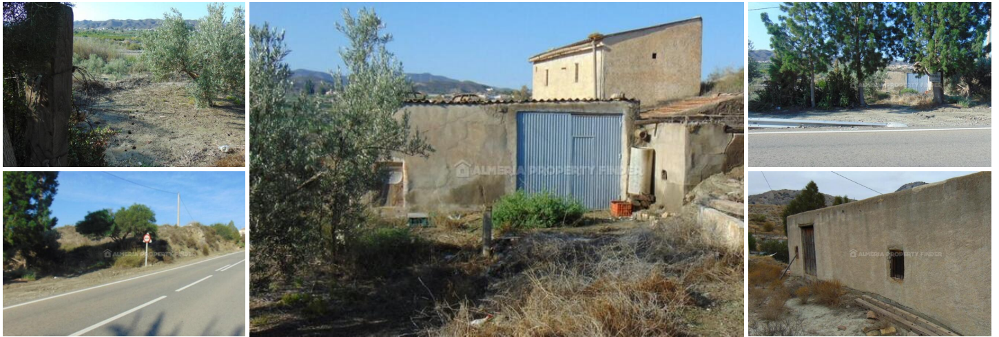
Almacén Paco - A country house in the Arboleas area. (For Renovation)

Finca with 143 m 2 built, 5.307 m 2 land area, 2 floors, to be renovated, 100 years old.