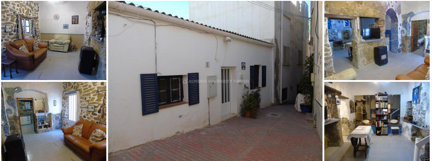
Casa Turre - A town house in the Turre area. (Renovated)