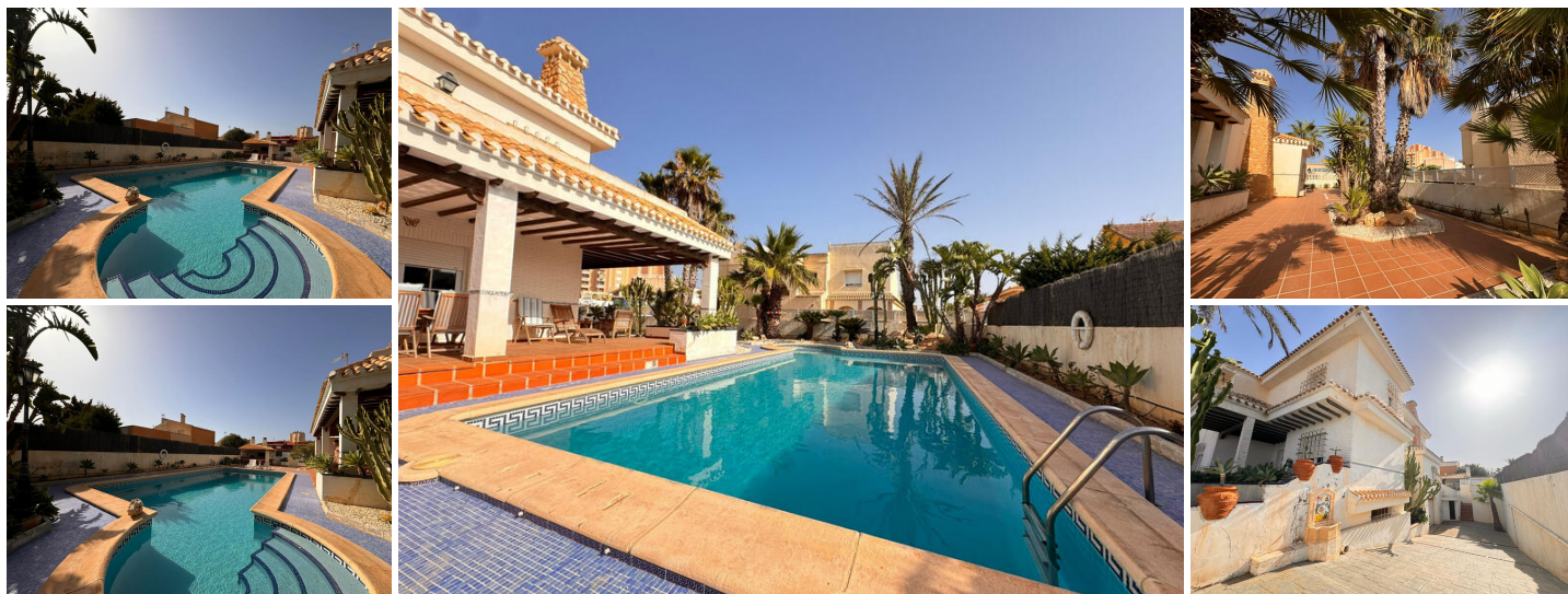
Charming South-West Facing Detached Villa in La Manga Del Mar Menor

Discover your dream home just a short stroll away from pristine beaches, vibrant bars, delightful restaurants, and convenient shops. This spacious and inviting villa features five bedrooms and four bathrooms, including two en-suites. The well-appointed kitchen and practical utility room offer functionality and style, while the expansive basement provides ample storage and potential for additional development with 200 m 2 of buildable space.