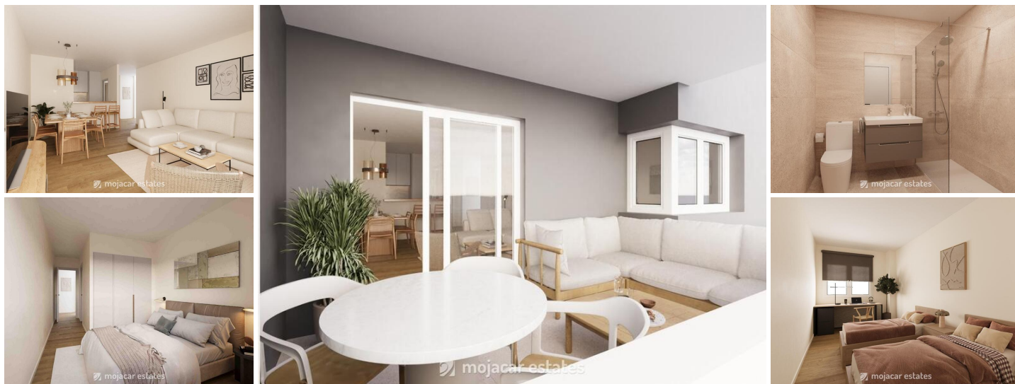
Terrazas del Levante: Modern 2 Bedroom Apartments 300m from the Beach in Aguilas, Murcia.

Discover Terrazas del Levante, a brand-new residential development in Águilas, just 300 metres from the beach. This exclusive community offers 2 and 3-bedroom apartments, each with spacious terraces, a private garage, and a storage room. Designed for modern comfort, these homes feature bright, open interiors and high-quality finishes, ensuring a perfect blend of style and functionality. Residents will enjoy a gated community with a large swimming pool, landscaped gardens, and a communal lounge—ideal for relaxation and socialising.