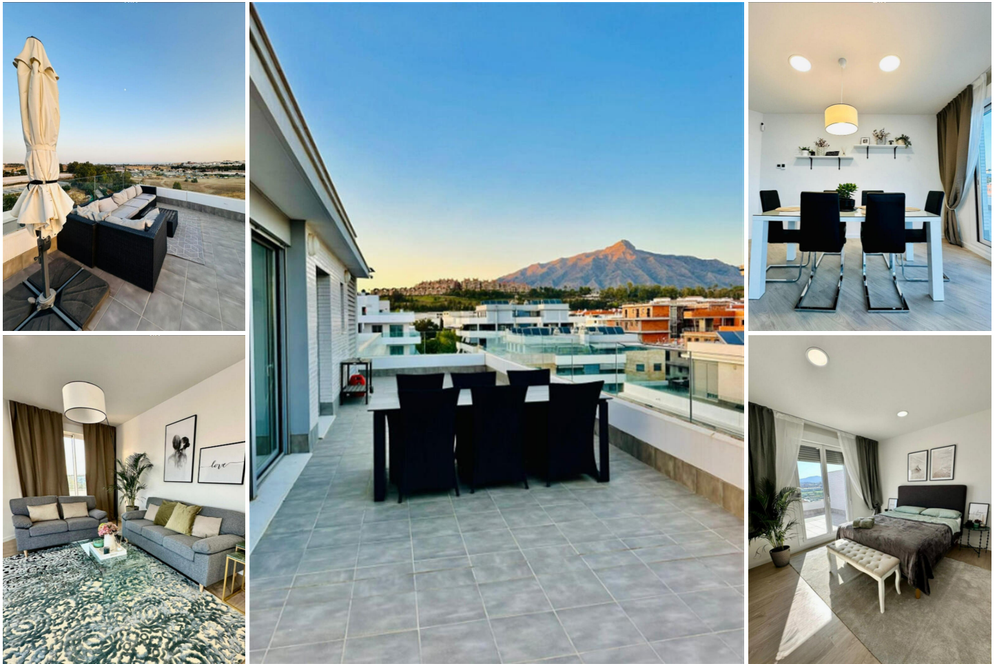
Fabulous Penthouse with Panoramic Views in Nueva Andalucía

Discover this stunning penthouse in Jardines de Guadaiza, a prestigious development located in the heart of Nueva Andalucía. Offering unparalleled panoramic views of the sea and mountains, this property is truly a dream home. The complex boasts an enviable location, just a short distance from all essential services, shops, restaurants, and bars, providing the perfect blend of convenience and luxury.