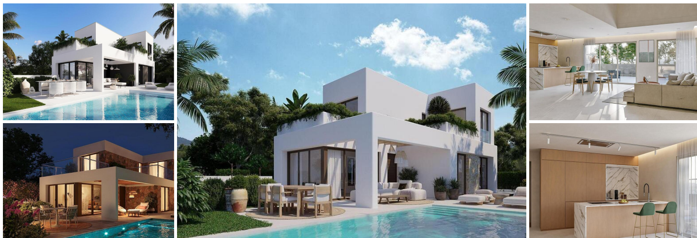
New Villas in Finestrat - Luxury, Nature and Sea Views