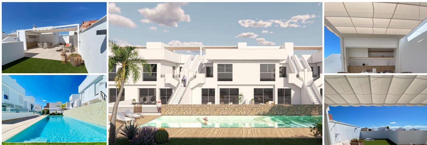
New Build Bungalow Residential Complex in Pilar de la Horadada