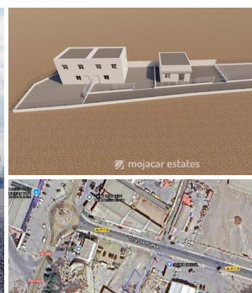
Adaptable Warehouse with Plot For Sale in Vera Pueblo, Almería, Andalusia.

Versatile warehouse with excellent potential, located on the outskirts of Vera Pueblo, Almería. Set on a 200 m² plot, this spacious 122 m² property offers two floors and a non-trafficable roof. With a completed exterior finish and an open-plan interior, it provides a flexible canvas to suit a variety of uses, from business operations to a stylish office or even tourist flats, thanks to its industrial land classification.