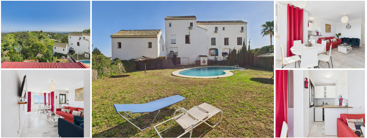
Spacious 3-Bedroom Apartment with Sea Views in Forest Hills

This bright and airy 3-bedroom apartment offers breath taking sea views from both the living room and the bedroom.. Located in the sought-after Forest Hills area, this spacious unit is a rare find as it combines two apartments into one, providing an expansive living space.