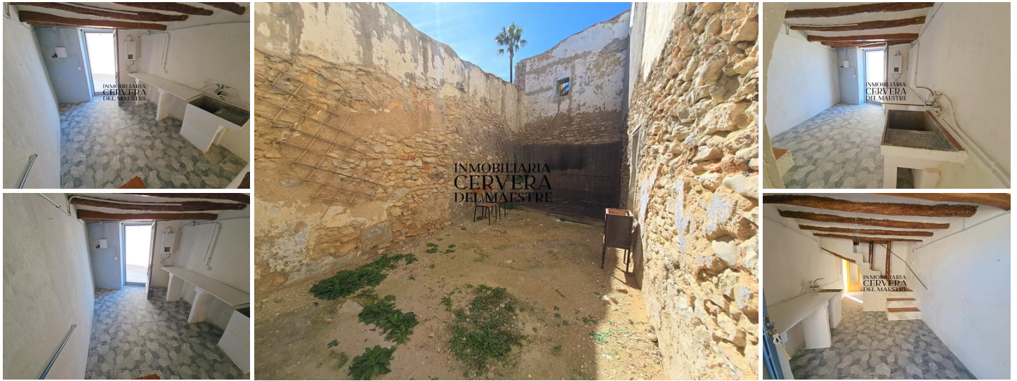
Town House of 82m2 in Calig With Annex / Court Yard.

Renovated house of 82m2 distributed over three floors located on the outskirts of the historical town of Calig, and with an annexed plot of 34m2.