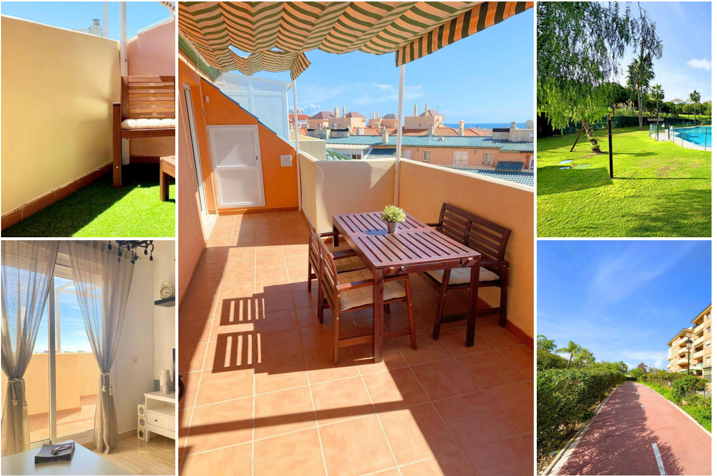
FANTASTIC PENTHOUSE WITH TERRACE AND SEA VIEWS. San Luis de Sabinillas.

Great apartment, with an unbeatable location, in the heart of Sabinillas, next to supermarkets, schools, pharmacies... and only 5 min walking distance to the beach and the promenade, which connects all the costa del sol, where you will find a great selection of beach bars, restaurants and leisure areas.