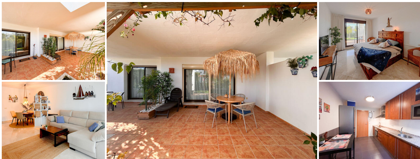
Apartment in Casares Golf Garden.

This modern 2-bedroom, 2-bathroom apartment is located in the prestigious Casares Golf Garden development, just a few kilometers from the coast. The apartment features a spacious and bright living room with a closed kitchen, perfect for cozy evenings. From the living room, you have access to a covered terrace that overlooks a private garden, ideal for enjoying the outdoor lifestyle.