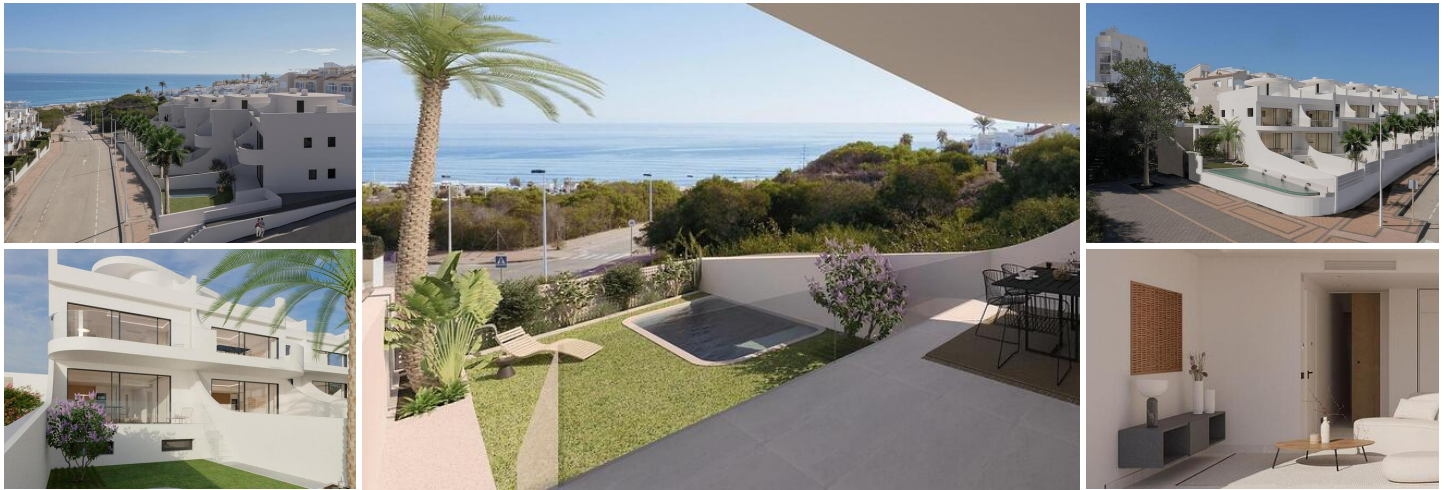
New Build Bungalows with Sea Views in La Mata, Torrevieja