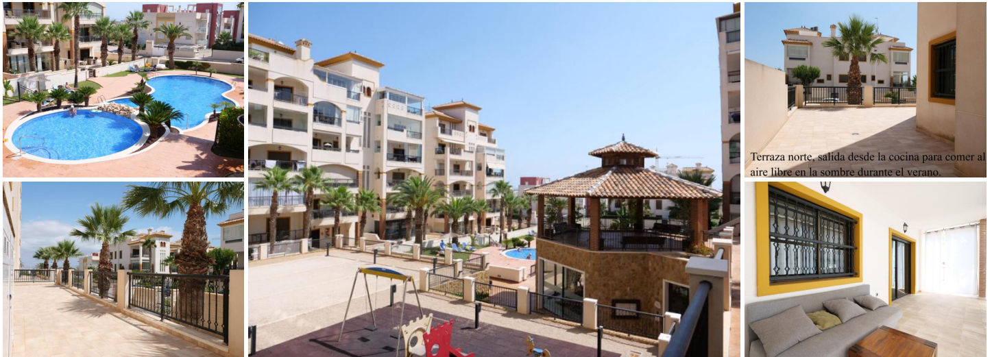
Terraza norte, salida desde la cocina para comer al aire libre en la sombra durante el verano.

We are pleased to offer this luxury apartment for sale marjal beach Guardamar del Segura.