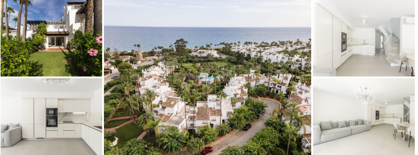
3-Bedroom Townhouse in Urb. Costalita, New Golden Mile, Estepona

This charming 3-bedroom, 3-bathroom townhouse is situated in the prestigious Costalita urbanization, in the heart of Estepona's New Golden Mile. With a two-story design, this property offers both comfort and space.