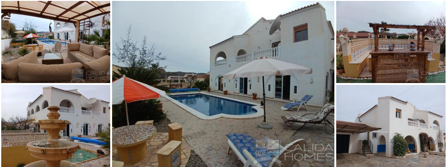
Villa de Sueños- House of Dreams – A Unique and Exceptionally Spacious 4-Bed, 4-Bath Property

Located within a lovely, established community and just a short walk to Arboleas, Villa de Sueños is an outstanding property that offers exceptional space, versatility, and a wealth of features. Whether you're looking for a large family home or a dual-family living arrangement, this villa is perfectly suited to both. Set within beautiful, low-maintenance gardens, the property boasts a heated swimming pool, covered carport, integral garage, poolside bar, and much more.