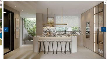
MARBELLA, CABOPINO – Brand-New Luxury Duplex Apartments

Discover an exclusive collection of just eight spacious duplex apartments in one of Marbella’s most prestigious areas, just 30 minutes from Málaga’s international airport.