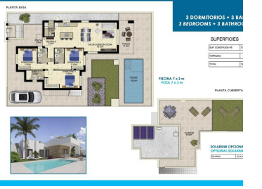
Stunning New Build Villas in Polop with Sea Views

Modern Villas with Spacious Plots and Private Pools