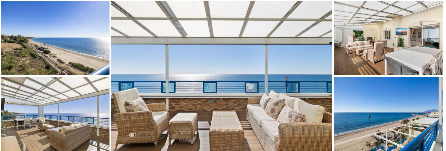
Exclusive Frontline Beach Penthouse - Panoramic Sea and Port Views

This is your unique opportunity to live the dream in front of the sea! Imagine waking up every morning to the soothing sound of the waves and enjoying spectacular sunrises and sunsets from the beachfront. This exclusive and unrepeatable penthouse offers you panoramic views that will leave you speechless.