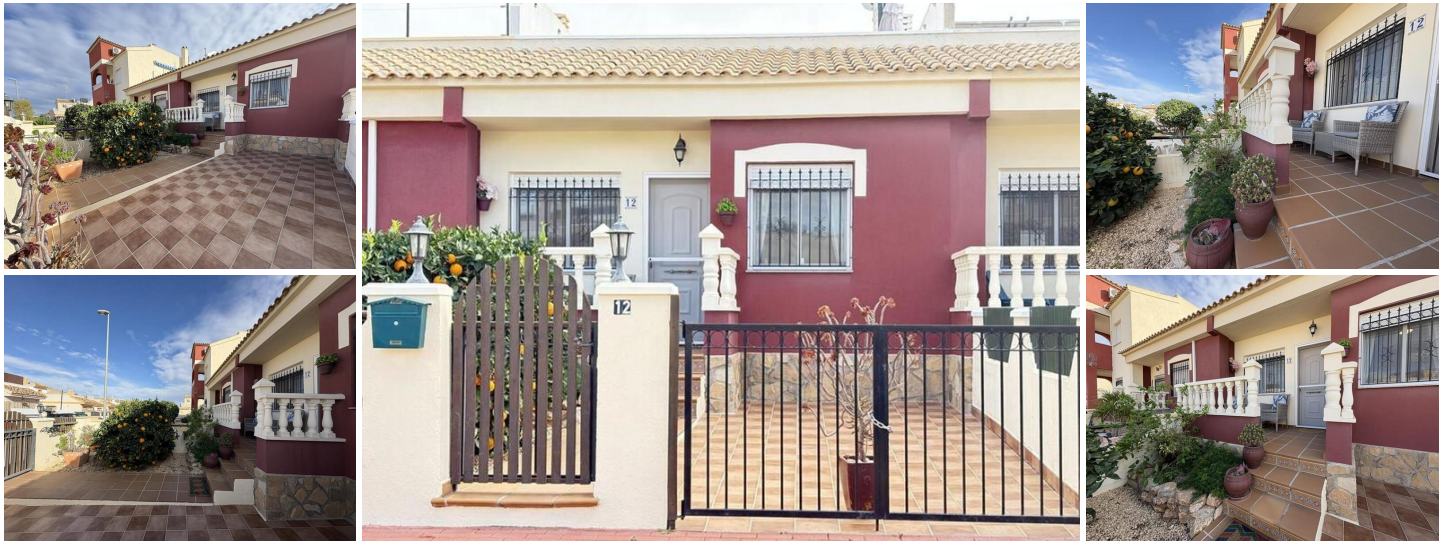
Charming One-Story Townhouse with Solarium in Sucina

This lovely two-bedroom, one-bathroom townhouse is the perfect home for those seeking comfort and tranquility. The property is all on one level and features a spacious 35m 2 front porch, ideal for relaxing or enjoying outdoor dining.