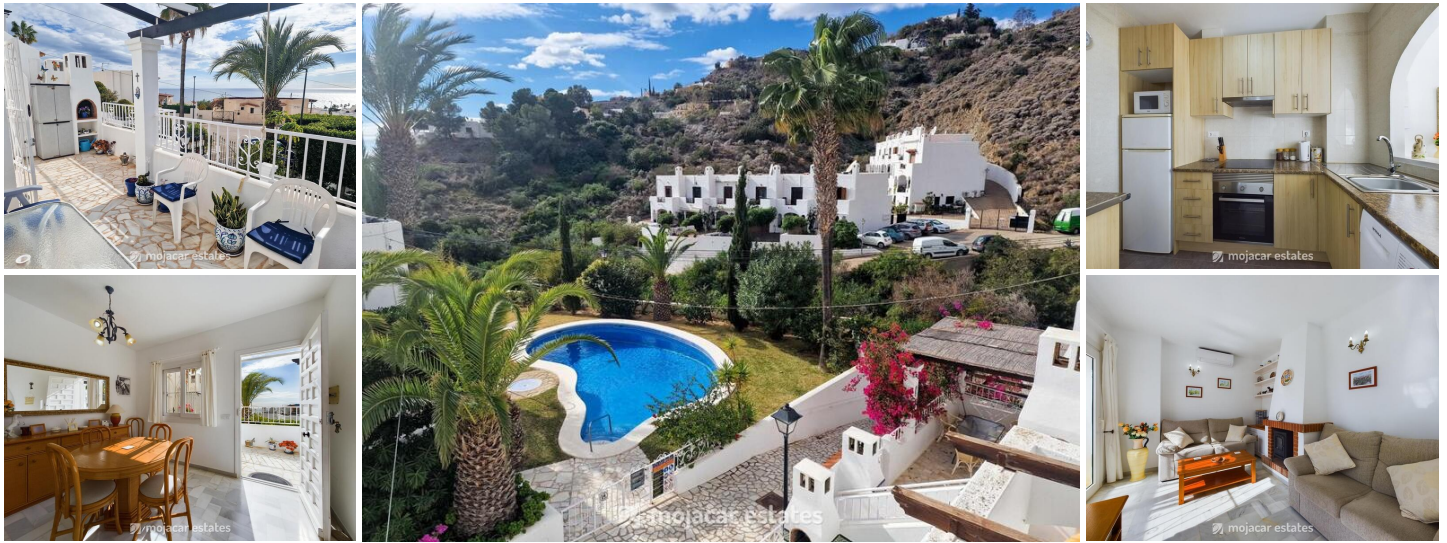
Sea-View 2-Bed Apartment with Terrace & Pool For Sale – 350m from Beach on Mojacar Playa, Almeria, Andalusia.

This top-floor, first-floor apartment offers stunning sea and mountain views from its spacious 19m 2 terrace, just 350 metres from the beach. Situated in an exclusive development of only 16 units, this well-maintained home is ideal for both personal use and rental investment. The terrace overlooks beautifully landscaped gardens and a communal pool, with a built-in BBQ and an awning for shade—perfect for outdoor relaxation.