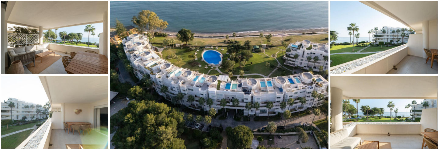
Luxurious Ground-Floor Apartment with Stunning Sea Views in New Golden Mile

A spacious, bright, and fully renovated ground-floor apartment with a modern design and stunning direct views of the sea and the complex. This property features 2 bedrooms, 2 bathrooms, and a terrace, perfect for enjoying the breathtaking scenery.