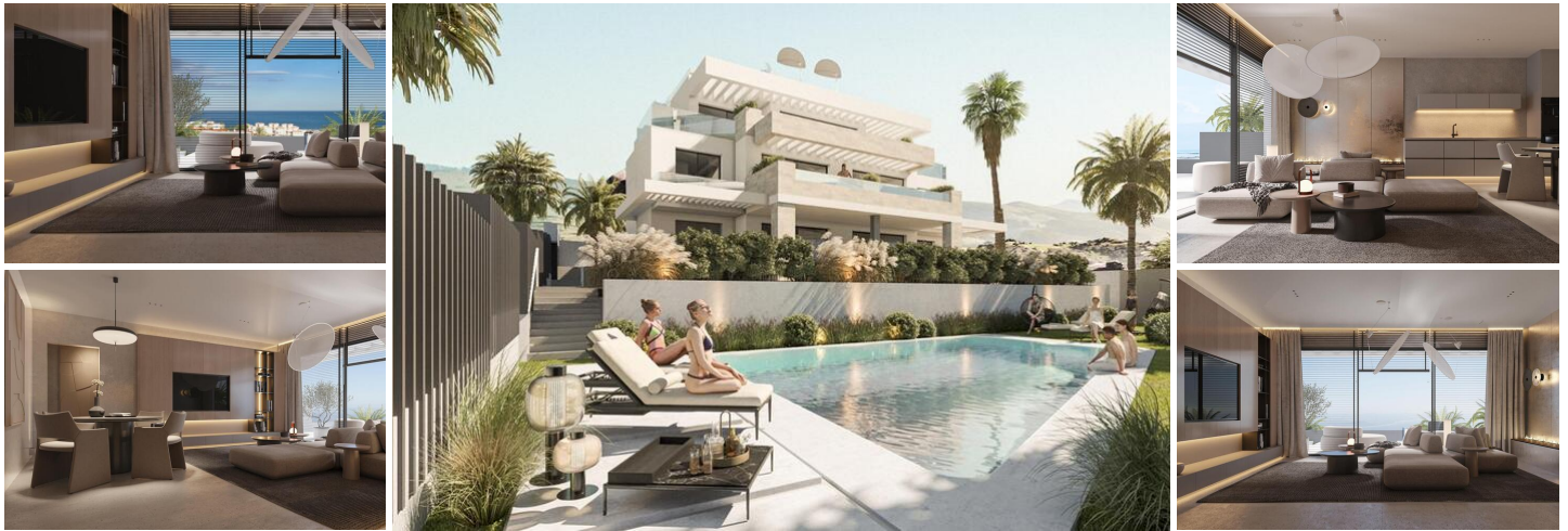
NEW BUILD RESIDENTIAL COMPLEX NEAR ESTEPONA

New Build residential complex of luxury apartments in Buenas Noches, near Estepona