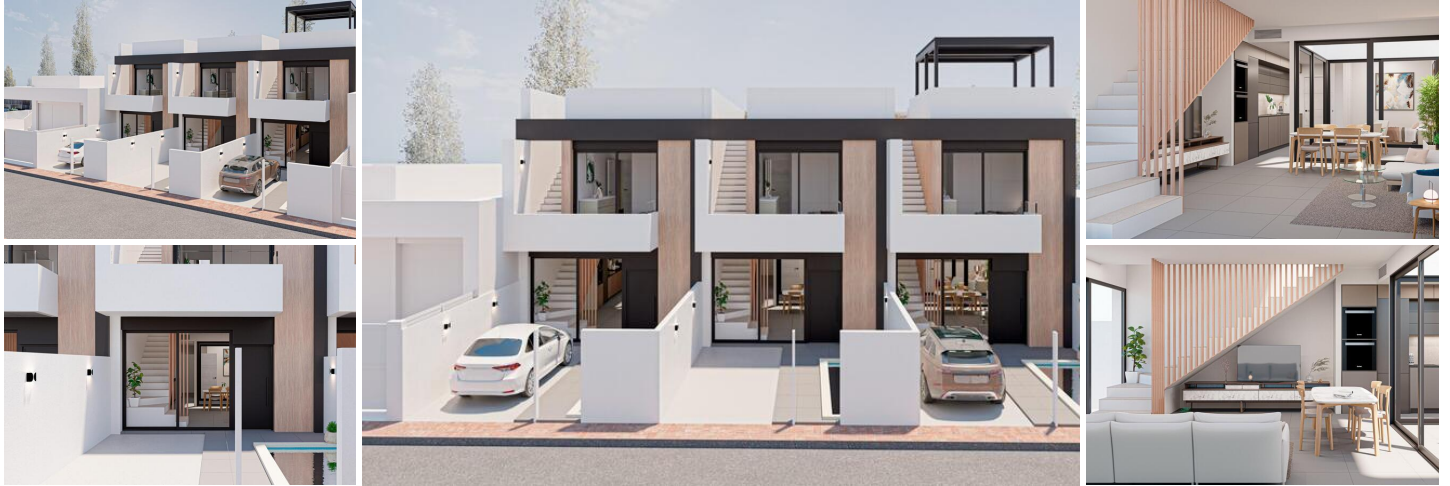
New Construction Townhouses in San Pedro del Pinatar