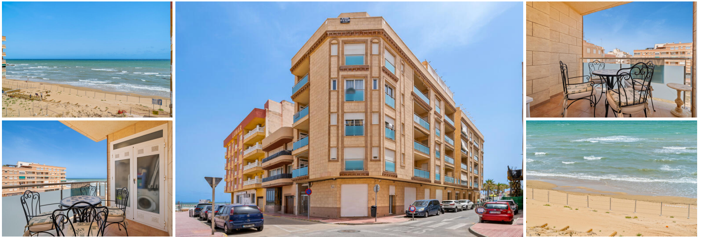
First line apartment with sea views in La Mata - Torrevieja

The apartment is located in the third floor and has a living area of 84,73 m2. It consists of two double bedrooms and two bathrooms, where one of them is en-suite connected to the master bedroom. The master bedroom have fitted wardrobe. Furthermore the apartment consists of an open plan kitchen, dining and living area. From the living room you have direct access to a terrace.