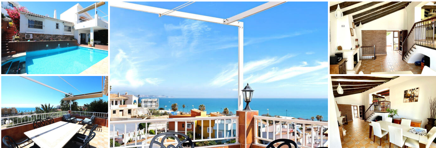
Charming Villa in Fuengirola, 400m from the Beach

This magnificent villa with stunning views is located on the border between Mijas and Fuengirola, just 400 meters from the sea. It offers panoramic sea views from its privileged position.