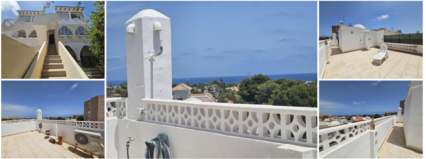
LA ZENIA BEACH SIDE WITH SEA VIEWS.

Incredible investment opportunity to purchase this 3 bedroom, 2 bathroom duplex penthouse apartment with wonderful sea views of the Mediterranean. Located beachside of La Zenia this property is less than 700m from the beach and a 5 minute walk from the famous Paddy's Point and Brown's cocktail bar. The duplex apartment is built across 2 levels with the lower level comprising of an open plan lounge and dining room with an American style fully fitted kitchen, a family bathroom and 2 double bedrooms. There is also a very sunny glazed terrace providing an extra dining area. Upstairs is a spacious third bedroom and access to the spectacular solarium with impressive sea views.