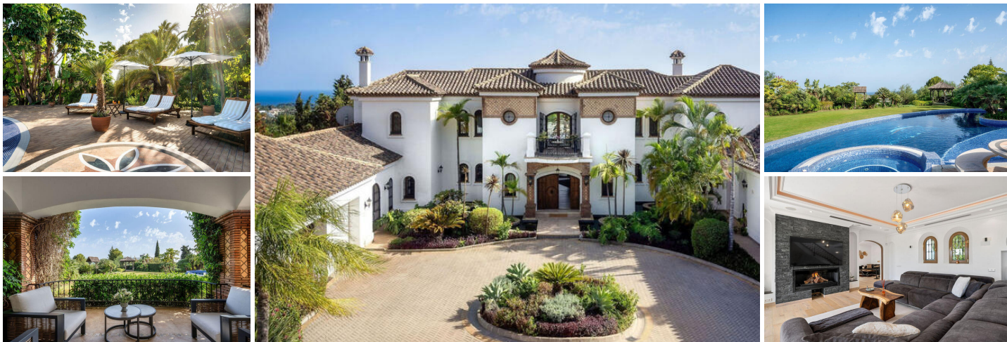
Villa El Paraiso: Luxurious Andalusian Elegance in Benahavis

Nestled in the prestigious El Paraiso Alto urbanisation of Benahavis, Malaga, Villa El Paraiso masterfully blends Andalusian charm with modern sophistication. Spanning 615 m 2 across two levels, this villa, built in 2006 and renovated in 2020, offers six en-suite bedrooms, two guest toilets, and a seamless mix of rustic wood finishes and sleek modern decor.