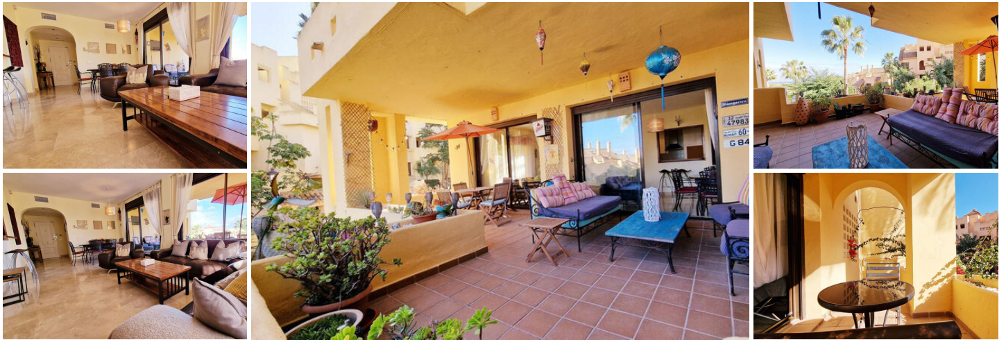
**Charming Three-Bedroom Corner Apartment in Duquesa Village**

Discover your dream home in the prestigious community of Duquesa Village. This spacious three-bedroom apartment offers a perfect blend of comfort and style, featuring two terraces with stunning views of the communal gardens and pool with some sea views. Just a 15-minute walk or a quick 3-minute drive takes you to the beautiful beaches, vibrant bars, and bustling marina of La Duquesa.