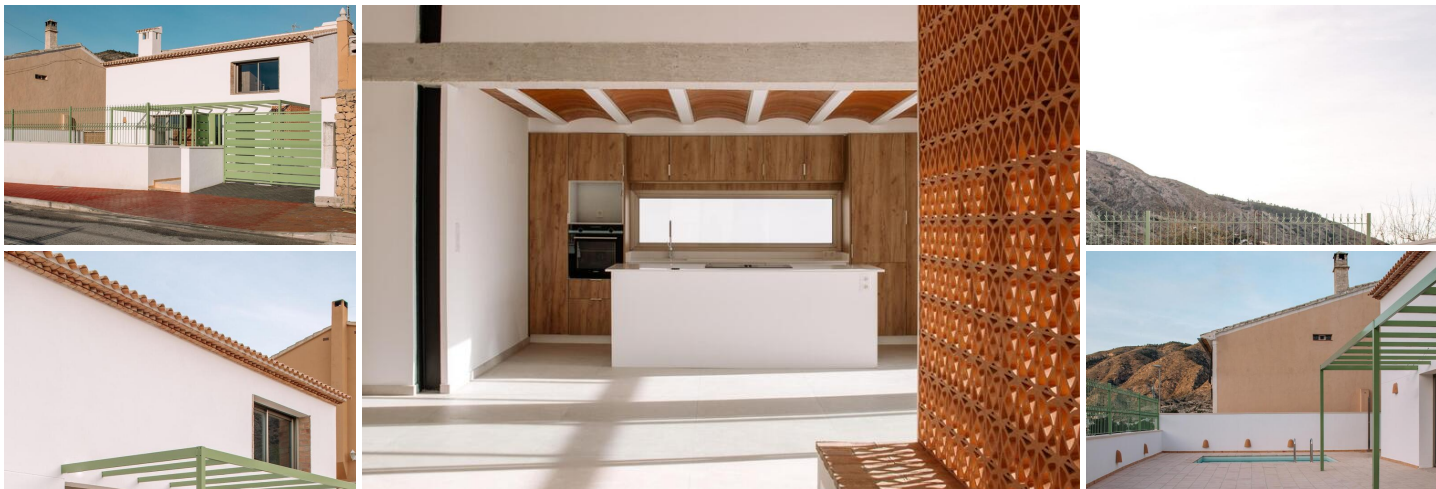
NEW BUILD VILLA IN ORXETA

New Build a single-family house in Orxeta, a peacefully town in a beautiful and fertile valley on the banks of the Sella river, and near to the coast The house is distributed on two floors and exteriors for leisure with swimming pool and private car park