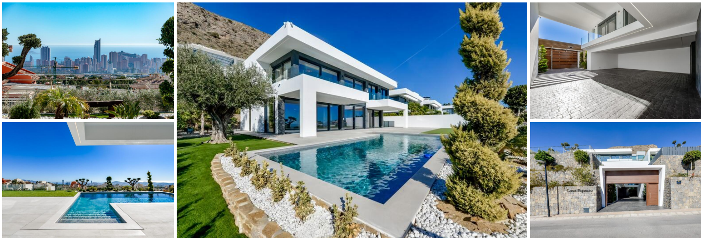
NEW BUILD LUXURY VILLA IN FINESTRAT WITH THE SEA VIEWS

New Build Luxury villa with the sea views in Sierra Cortina, Finestrat