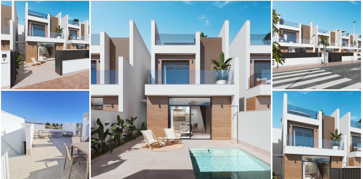
NEW BUILD VILLAS IN SAN PEDRO DEL PINATAR

New development of villas and townhouses in San Pedro del Pinatar, Murcia