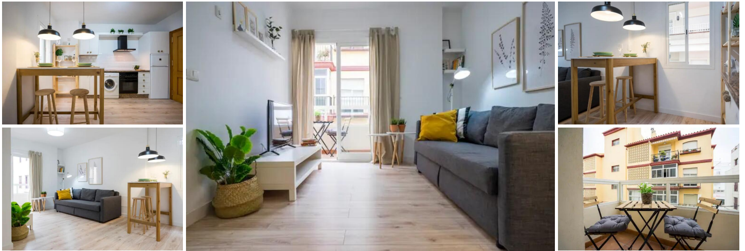
A One Bedroom Apartment For Winter Rental Located Near The Beach And Town

The apartment has been recently renovated, with aircon and heating. Has A Private Terrace and communal roof terrace with pool and views to the sea and mountains. The kitchen has a full oven and ceramic hob.