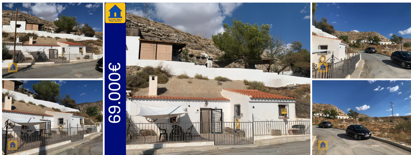
Cueva Wasabi in Galera

This is a quirky Spanish style cave house with a nice, spacious front patio with great views of the Badlands. The cave is located in a peaceful spot on the outskirts of Galera village, a 10-15 mins walk from the village centre. It's almost at the end of a dead-end road so there is little passage.