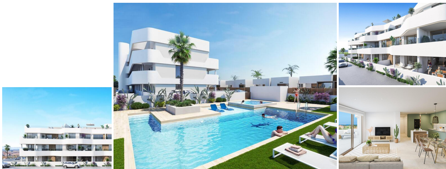
New Build Residential complex in Los Alcazares

Los Alcázares is an idyllic location for those looking to invest in a new residential property on the Costa Cálida. Just 25 minutes from Murcia Airport and approximately 55 minutes from Alicante Airport, this area is conveniently connected by highway to major cities like Cartagena, Murcia, and Alicante, as well as to other beautiful beaches along the Costa Cálida and Costa Blanca.