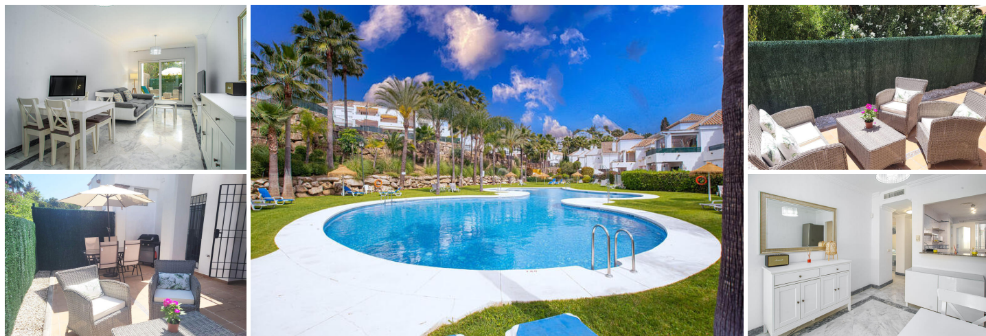
Apartment BRAHA - Nueva Andalucia

Privacy & Serenity, close to everything!