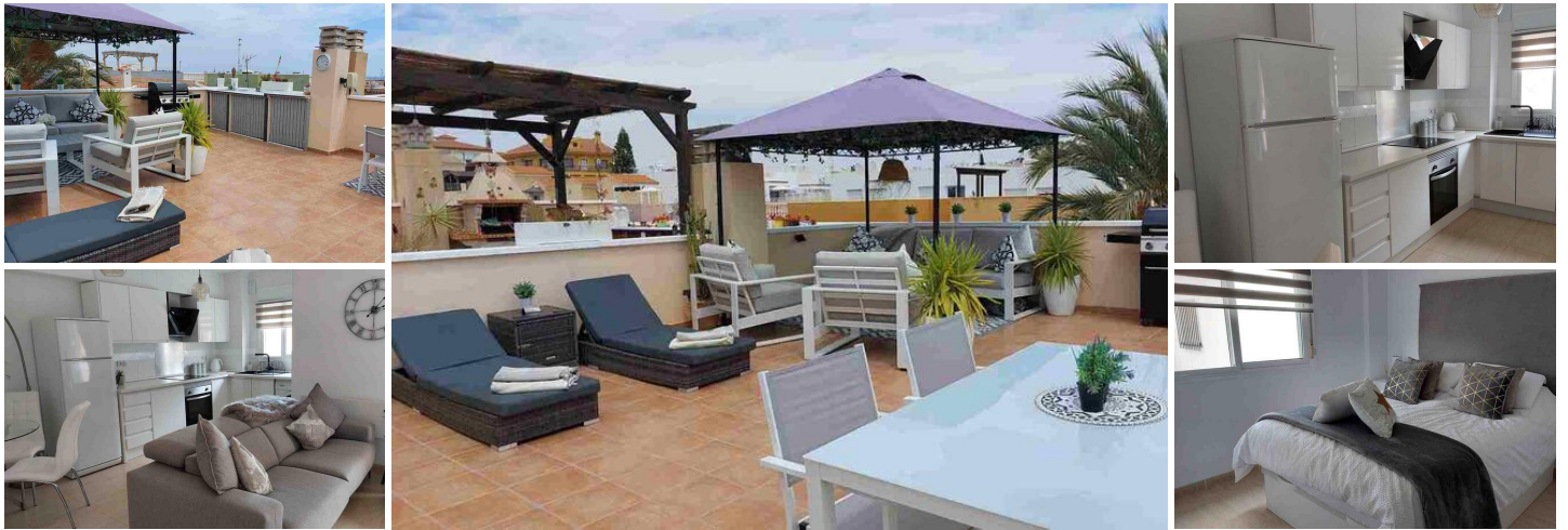
Luxurious Two-Bedroom Penthouse with Panoramic Sea Views - Balcones del Marques, Palomares

Discover coastal living at its finest with this stunning penthouse located in the sought-after Balcones del Marques development, nestled in the heart of Palomares. This recently modernized two-bedroom, two-bathroom residence offers a harmonious blend of contemporary elegance and Mediterranean charm.