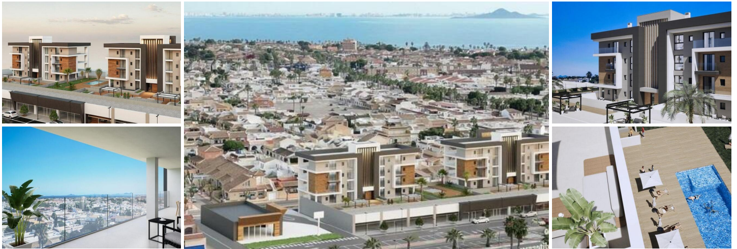
Tourist Apartments with Rental License in Los Narejos, Los Alcázares